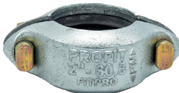
FITPRO® HOT DIP GALVANISED