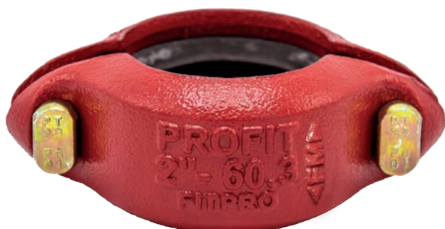
FITPRO® RED PAINTED RAL 3000